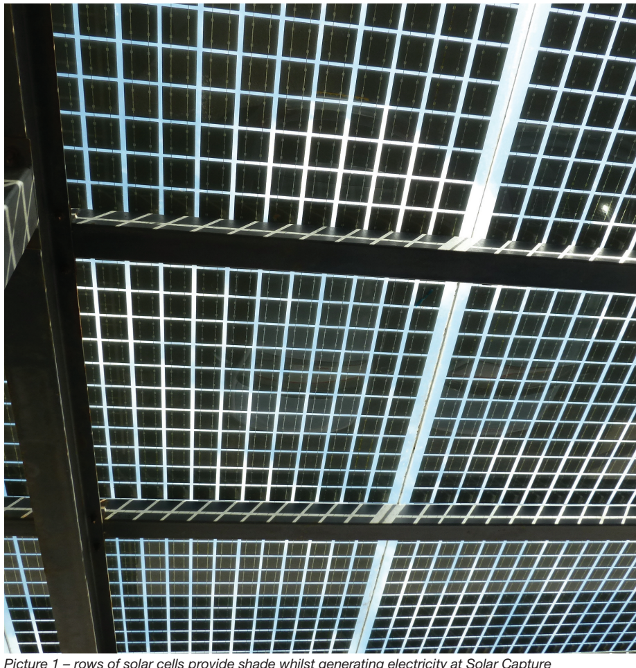
Picture 1 – rows of solar cells provide shade whilst generating electricity at Solar Capture Technologies, Blythe.

Inventive design is required to ensure that building inhabitants can experience sufficient