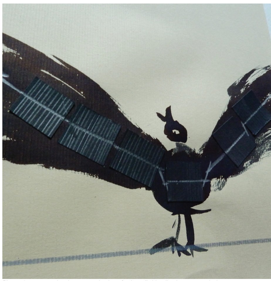
Picture 3 – cartoon showing a curved string of solar cells blending into a crow design.