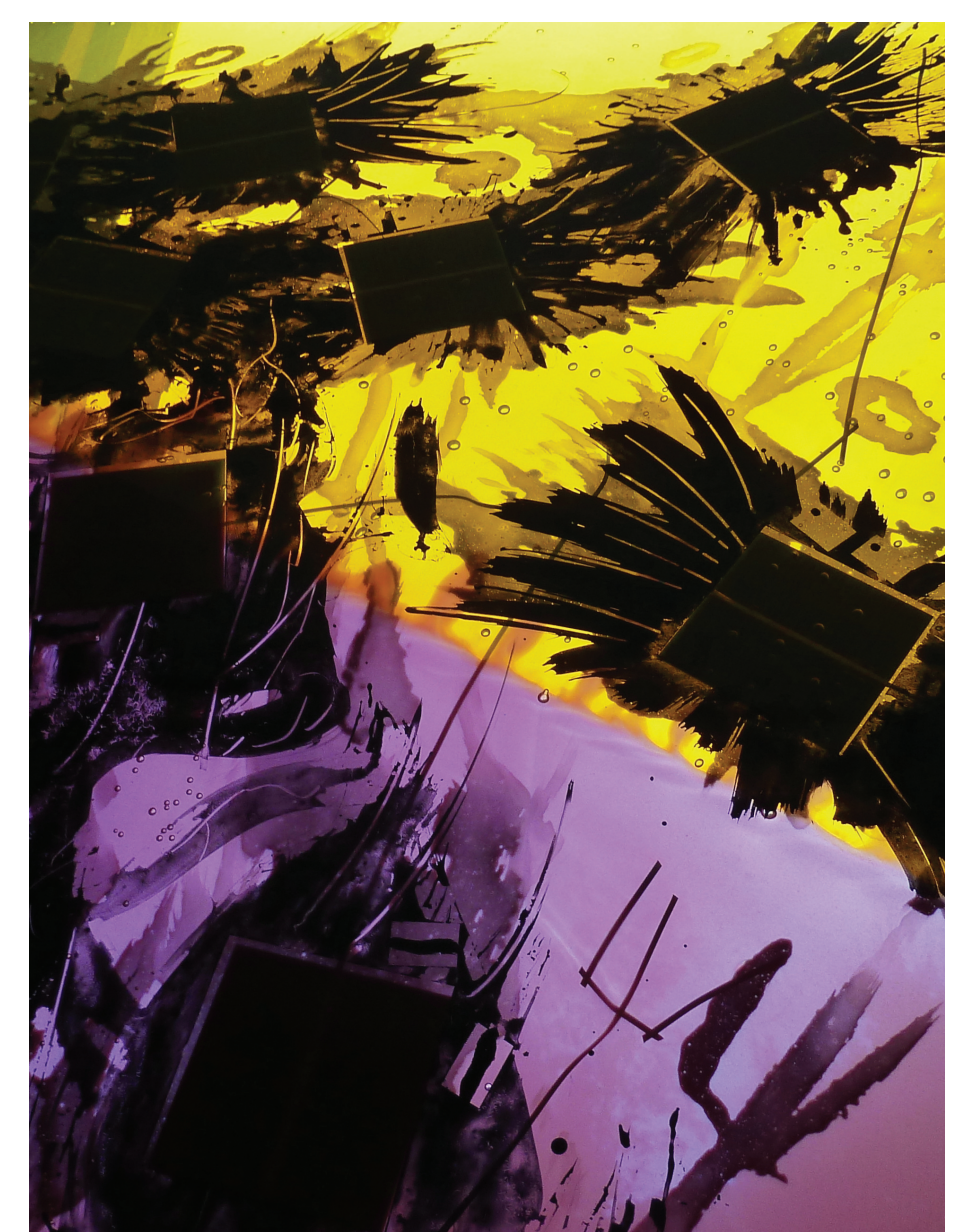
Picture 5 – fluorescent dyes add colour to a painted glass-glass laminate containing solar cells.

The siting of the solar cells need not be limited to the area of the glazing scheme.